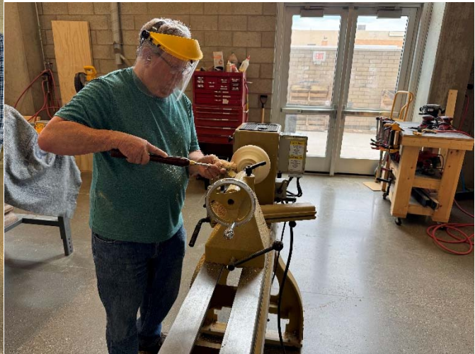
August Sawdust Session and Pioneer Village in Picture Butte