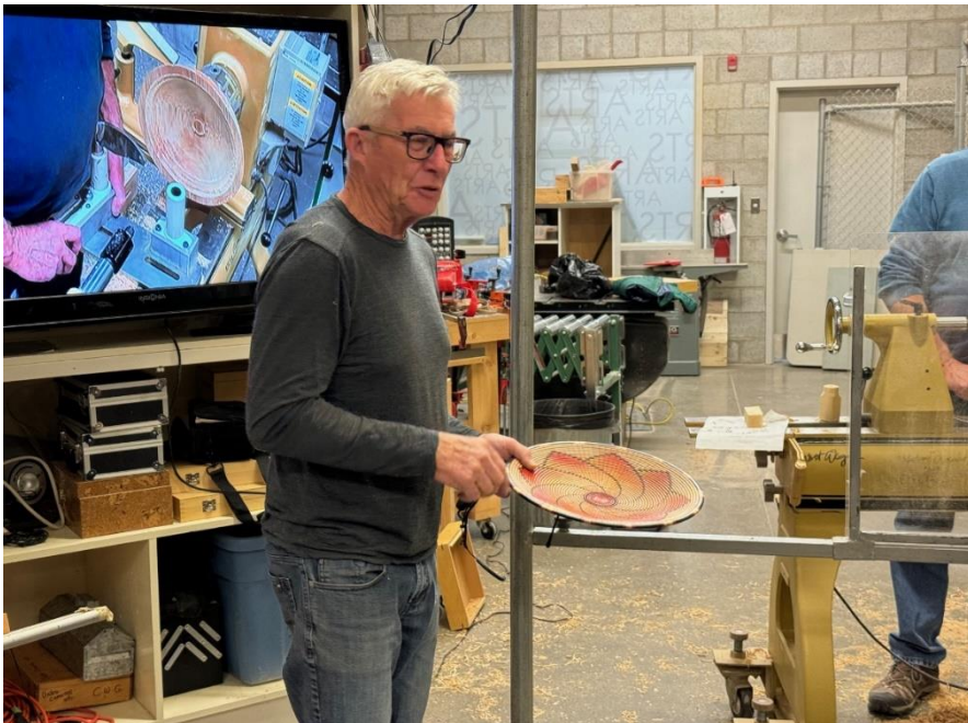
Roger. Great work as usual