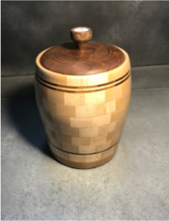
Beads of courage boxes.