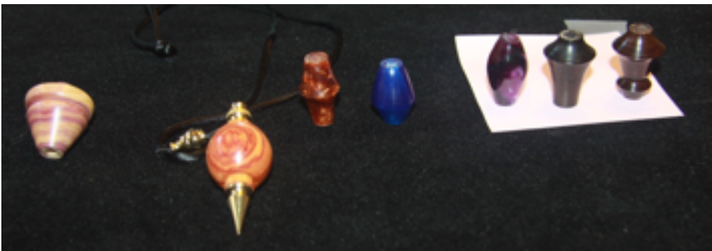
Pendants. They are 1 inch tall and about \frac{3}{4} inches in diameter. Terry Beaton