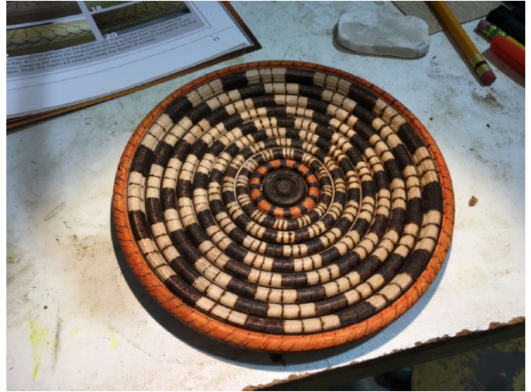
6" basket weave, trial run. Now I have received the right tools I'll try another. Dan Michener