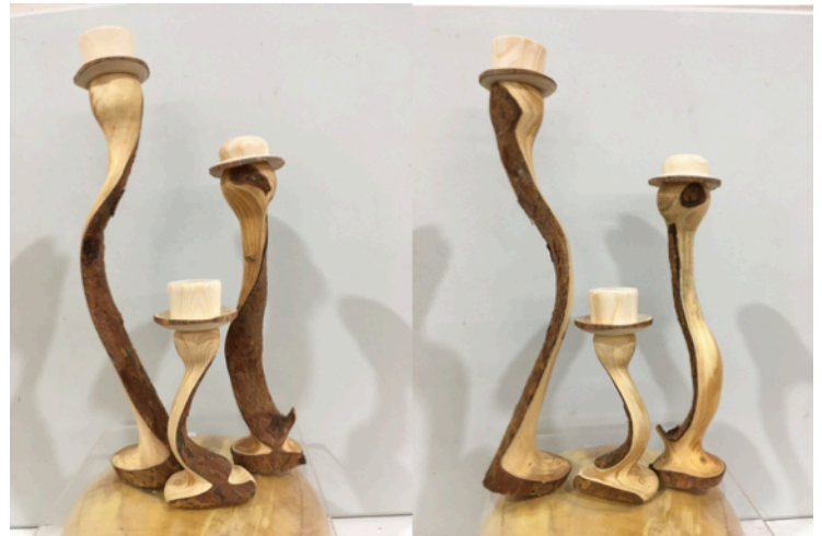
The Crook family stepping out. Scots Pine, tallest is 18". Dan Michener