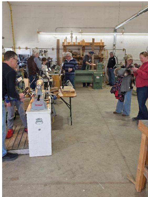
TNT 4H members and parents socializing and learning.