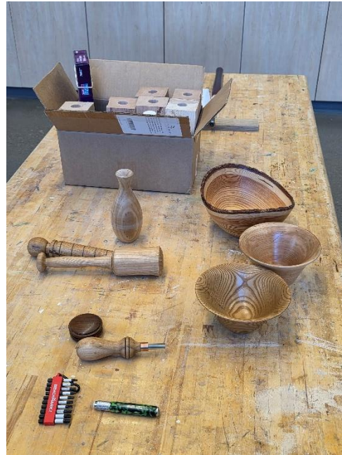
A display of projects organized by Terry for the development of TNT 4H students.