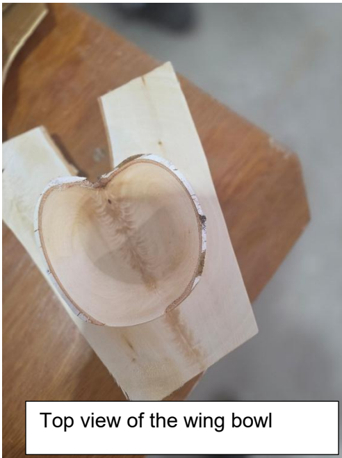
Top view of the wing bowl